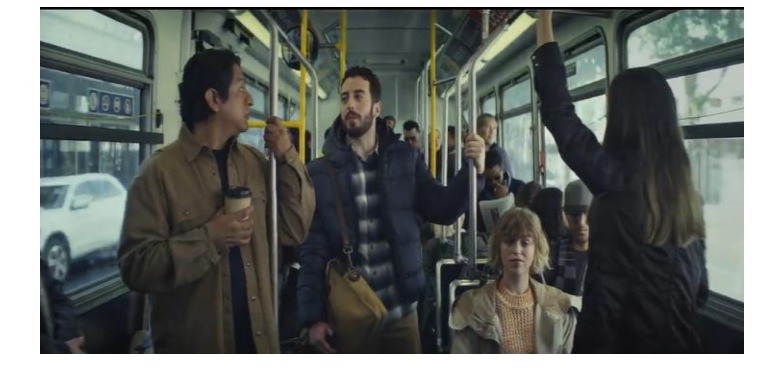
Scene 1 Scene 7

In analyzing the visual elements, the scenes are divided into three groups, such as: scenes contain an interaction between the actor and the other participants; scenes with no interaction between participants; scenes with written text. The interaction in here is an action when participants are represented as doing something to or for each other.